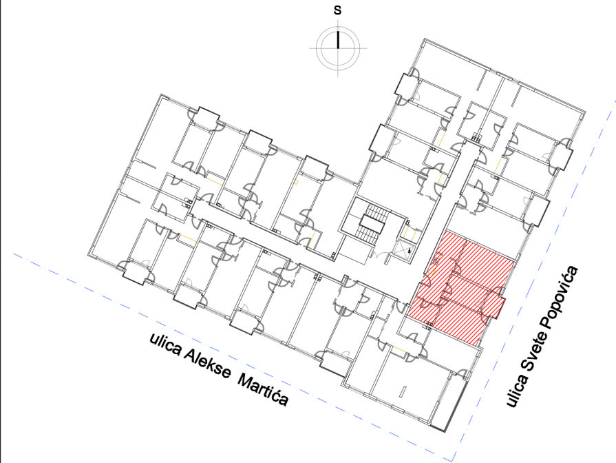
S 02 (S 15 = S 28 = S 41) - STAN 2 (dvoiposoban stan)